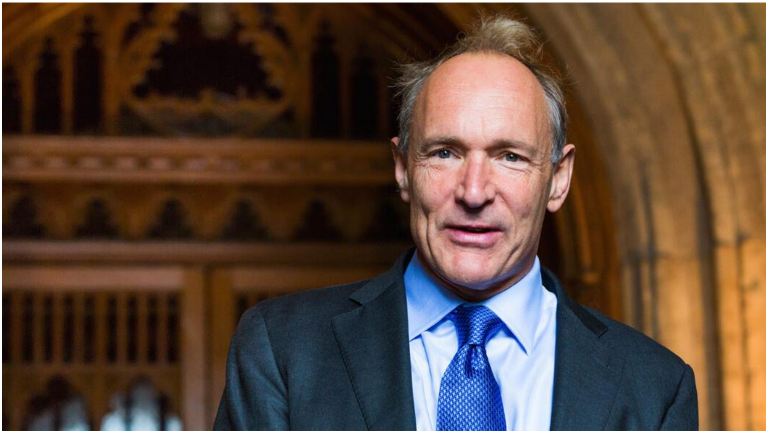
Tim Berners Lee