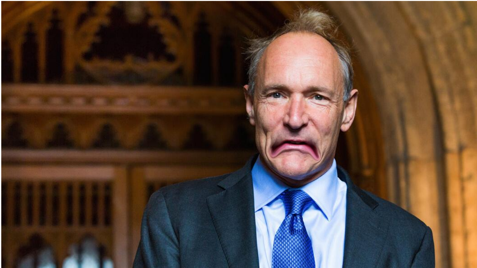
Tim Berners Lee