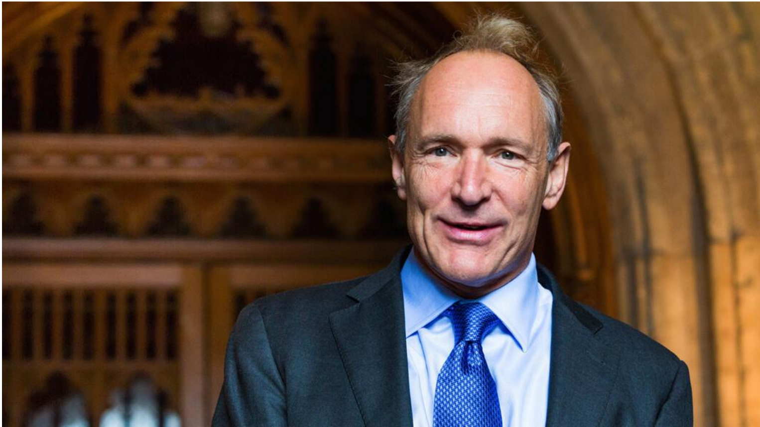
Tim Berners Lee